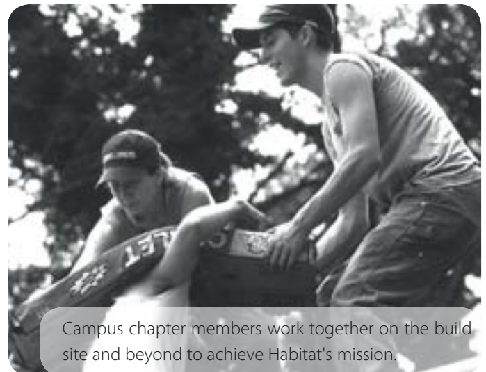
Campus chapter members work together on the build site and beyond to achieve Habitat’s mission.