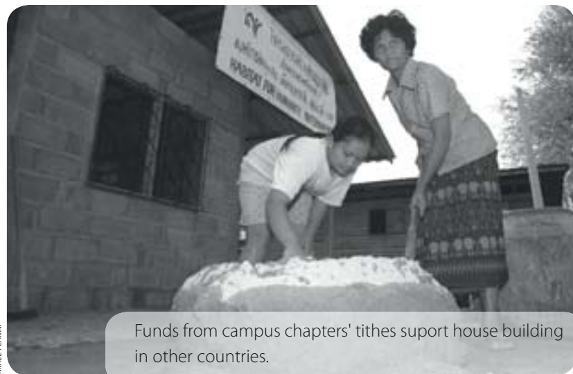
Funds from campus chapters' tithes support house building in other countries.

HabiFest continues to grow and be a success in getting students to advocate for affordable housing. This year 225 campus chapters participated in HabiFest. Among other activities, the participating chapters organized marches, wrote their representatives, held noontime prayer hours and called elected officials. By participating in these events students began to understand the scope of affordable housing issues and learned skills necessary to address them. Go to Page 20 to read more about how students participated in HabiFest.