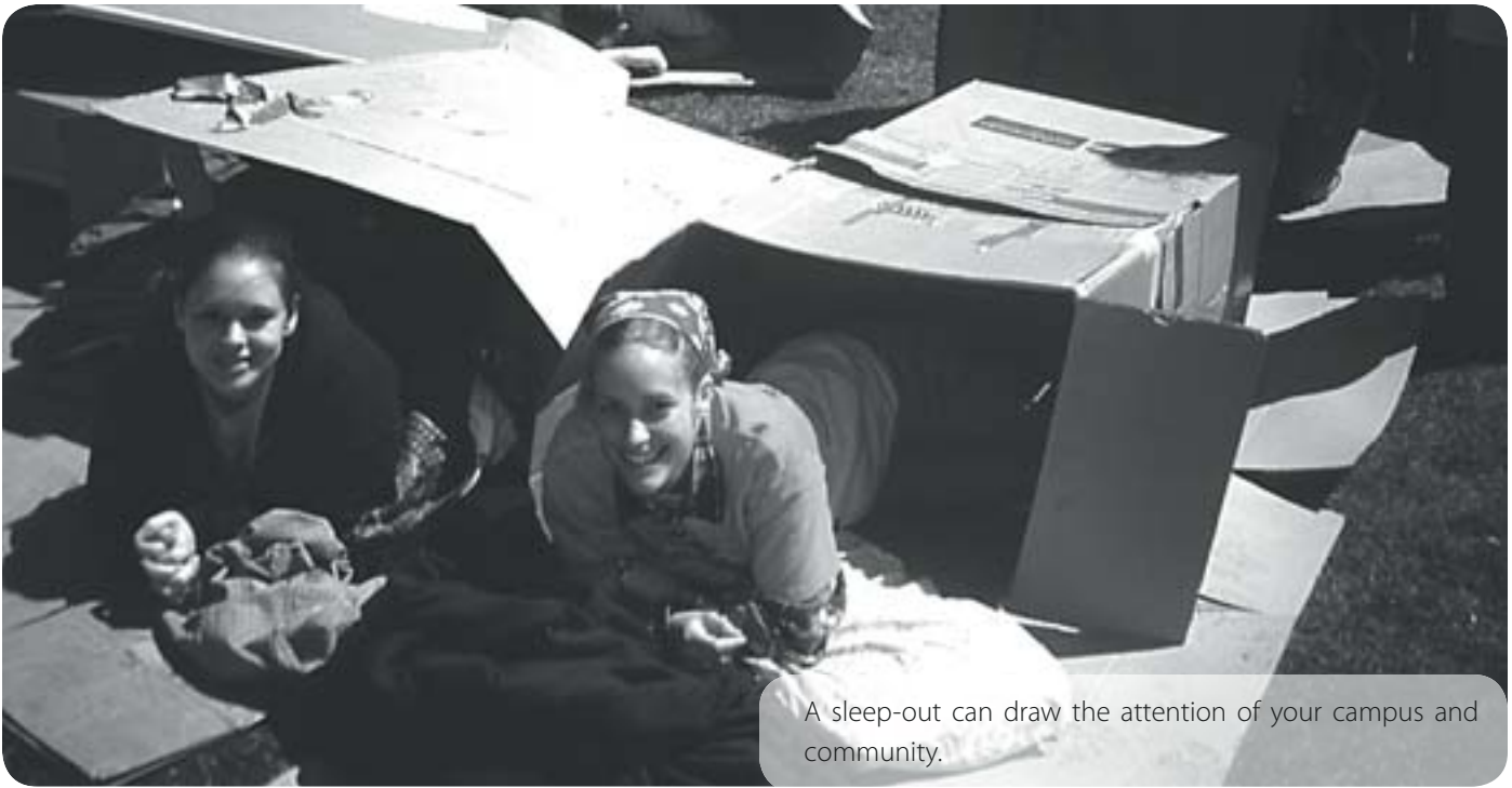
A sleep-out can draw the attention of your campus and community.

a “Pitt: Teach-in.” They focused on the primary goals of Habitat for Humanity and what Habitat is doing in the city of Pittsburgh to improve living conditions. The executive director of the local affiliate attended, as well as other housing organization leaders. The Pittsburgh chapter also does a good job of adding an educational component to their weekly chapter meetings. They focus on Habitat achievements and how substandard housing affects the world, and they have educational games that everyone participates in.