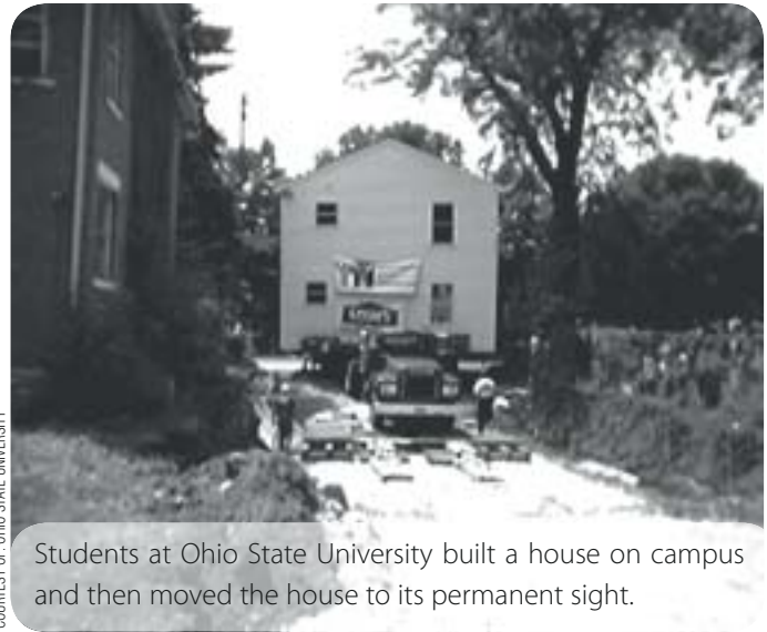
Students at Ohio State University built a house on campus and then moved the house to its permanent sight.

Barry University sponsored their first house this year. The house was built by students, faculty and staff. The chapter organized 17 building trips with an average of 15 volunteers per build day. The chapter also partnered with the Office of Mission and Ministry and Sodexo Dining Services to provide lunches for all the volunteers.