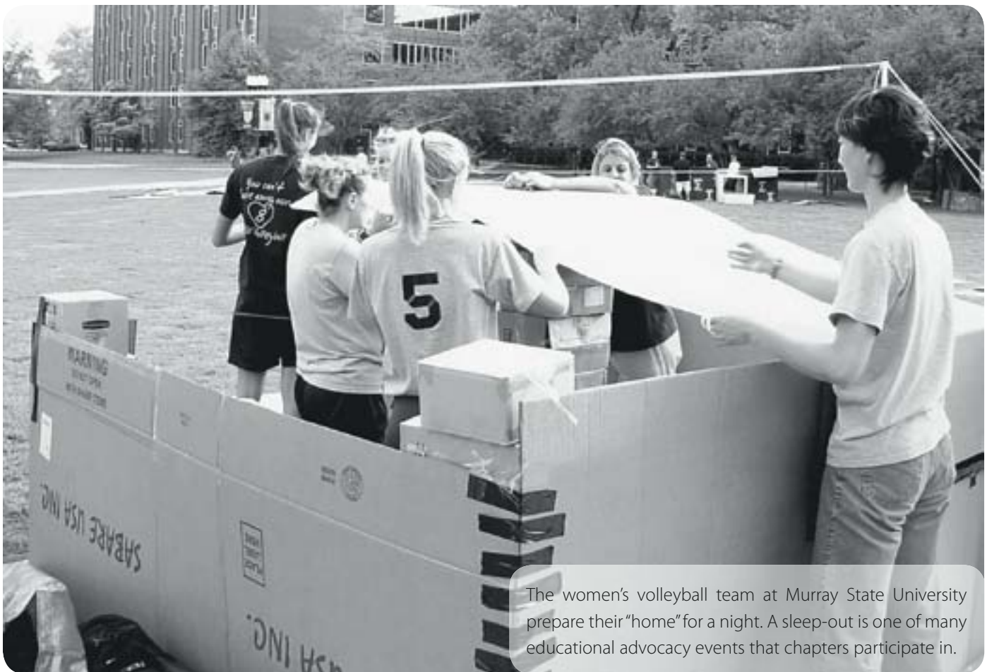
The women's volleyball team at Murray State University prepare their “home” for a night. A sleep-out is one of many educational advocacy events that chapters participate in.

The Youth United program has grown tremendously over the year, and with two more regions taking on the Youth United challenge this year (making it a truly nationwide program), expect even greater things to come. Check out the Youth United information on Page 10 and see how affiliates are participating in this great program.