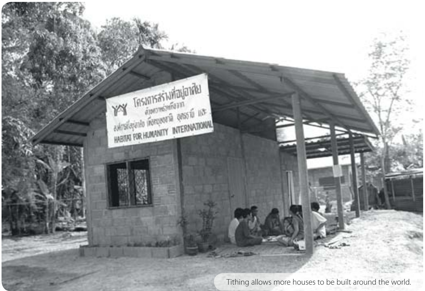
Tithing allows more houses to be built around the world.