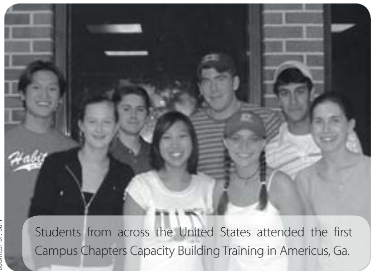
Students from across the United States attended the first Campus Chapters Capacity Building Training in Americus, Ga.