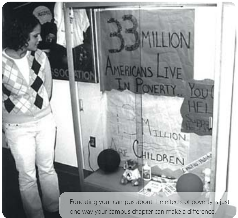
Educating your campus about the effects of poverty is just one way your campus chapter can make a difference.

The University of Pittsburgh campus chapter held